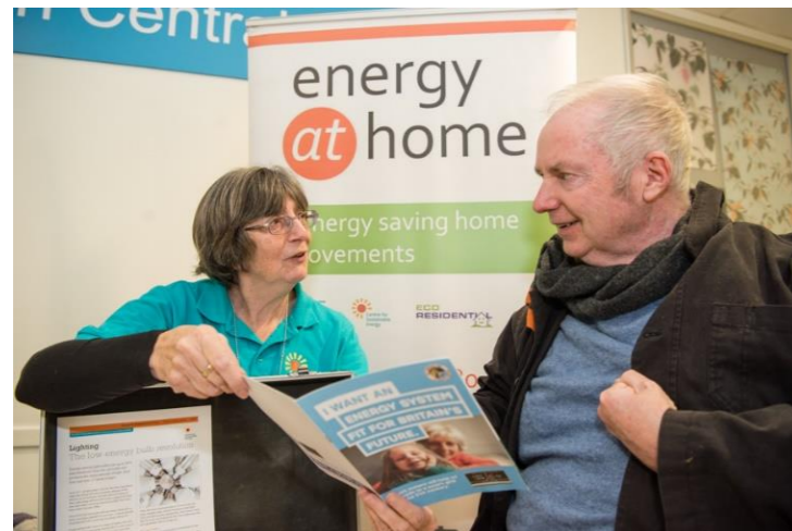
Our Energy At Home Advice Service provides residents with expert advice on heating, insulation and renewable energy