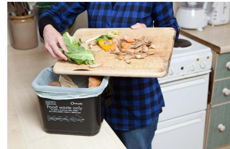
Food waste in Bath and North East Somerset is transformed into renewable energy to power thousands of homes