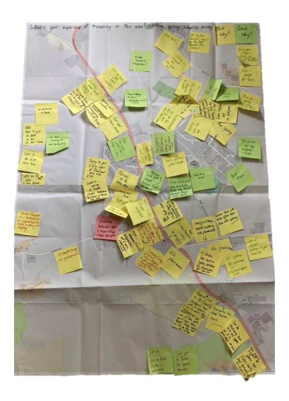
Map 1. Places participants disliked in Temple Cloud