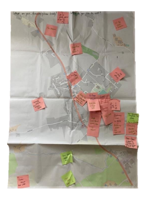
Map 2. Participants' favourite local places in Temple Cloud