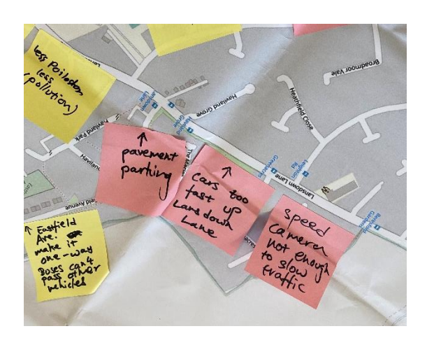
Map 1. Comments on Lansdown Lane