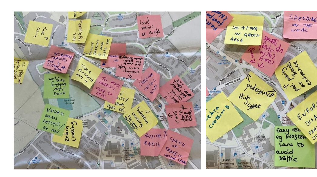
Map 3, 4. Comments on Weston High Street and surrounding roads

[I would like there to be] more variety of shops, pubs, etc.