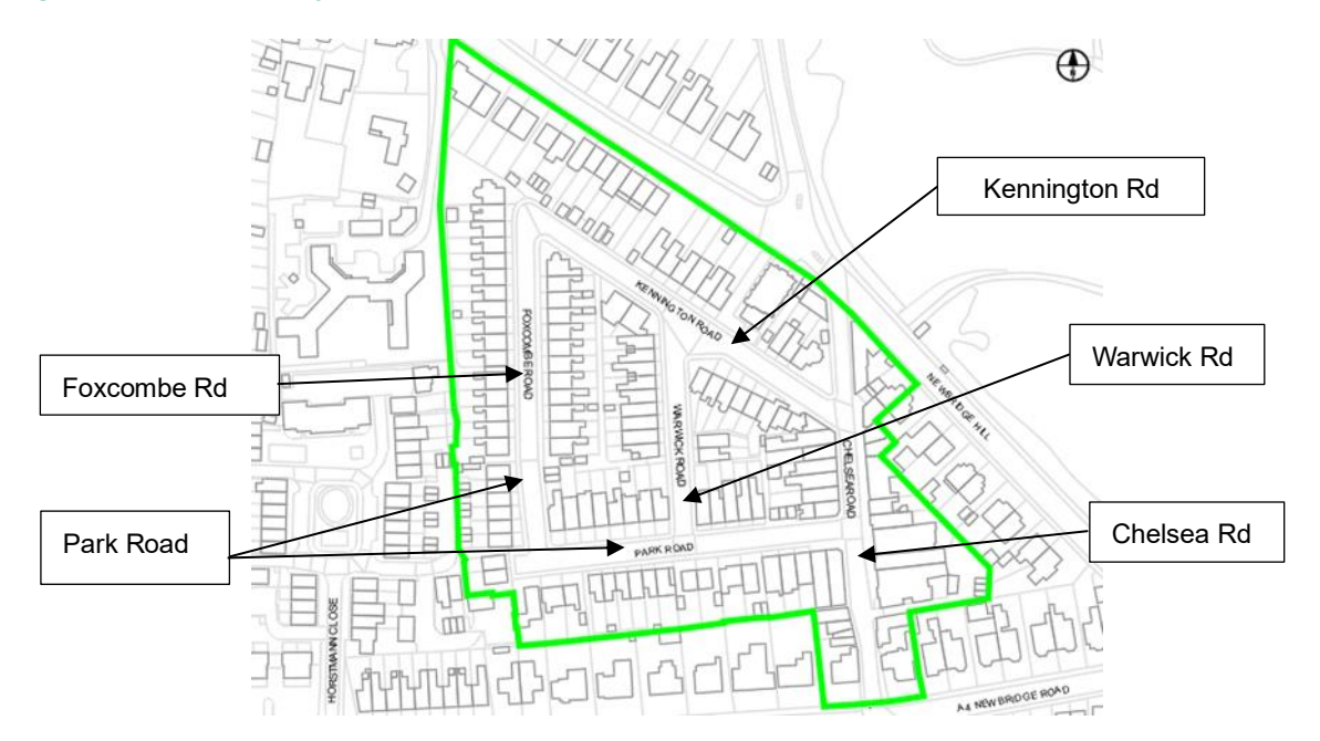
Figure 1: Zone Boundary Plan

The original study area is located west of Bath City Centre and north of the River Avon covering an area which includes Chelsea Road, Kennington Road, Warwick Road, Foxcombe Road, and Park Road. The western extent of the area is primarily a residential area with Chelsea Road being in the main part commercial properties with a mixture of retail and service businesses. The proposed RPZ boundary as presented in the initial consultation in May can be seen as a green border shown in Figure 1 below.