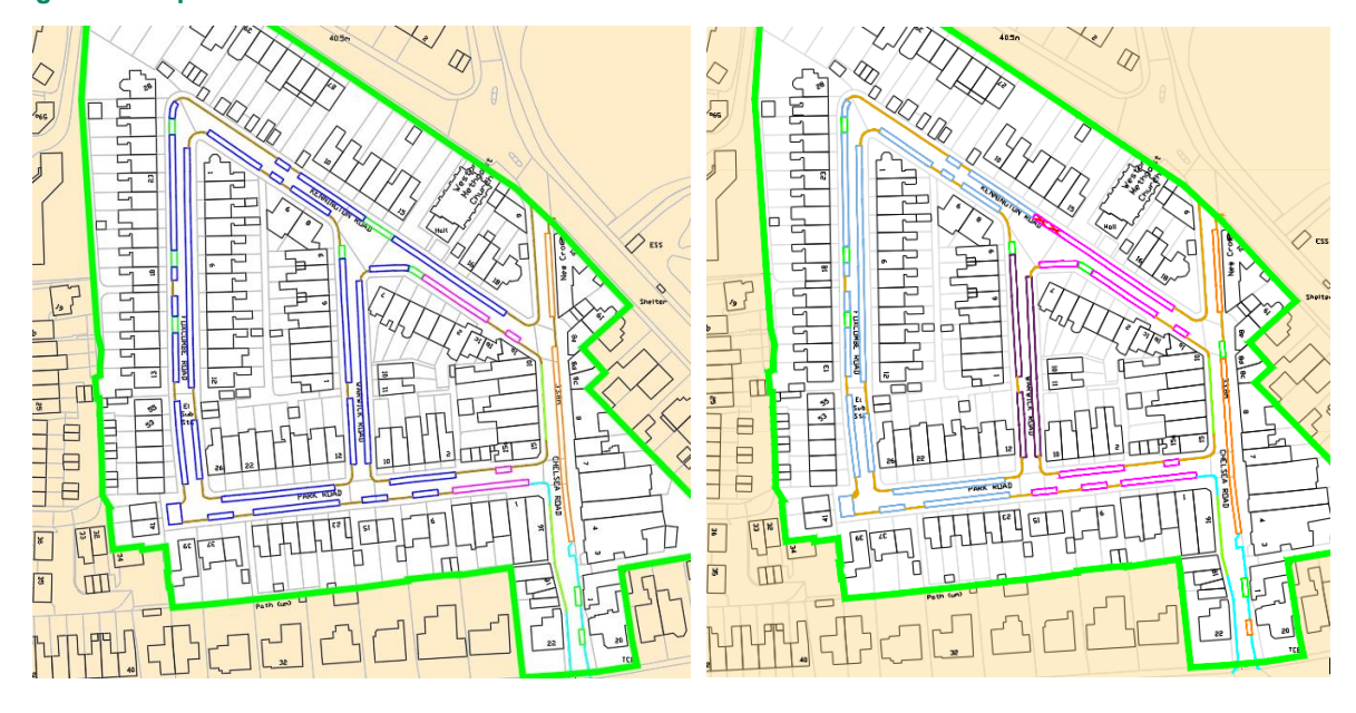
Figure 2: Proposals at consultation and as amended in line with comments

2) Convert the proposed new bay adjacent to property 20 Newbridge Road (proposed as disabled parking in the consultation pack) to 1 hour limited waiting. Maintain both the proposal to introduce a new disabled bay outside property number 1 Chelsea Road, and the introduction of loading restrictions to prevent obstructive parking and maintain clear road space for other vehicles in this area.