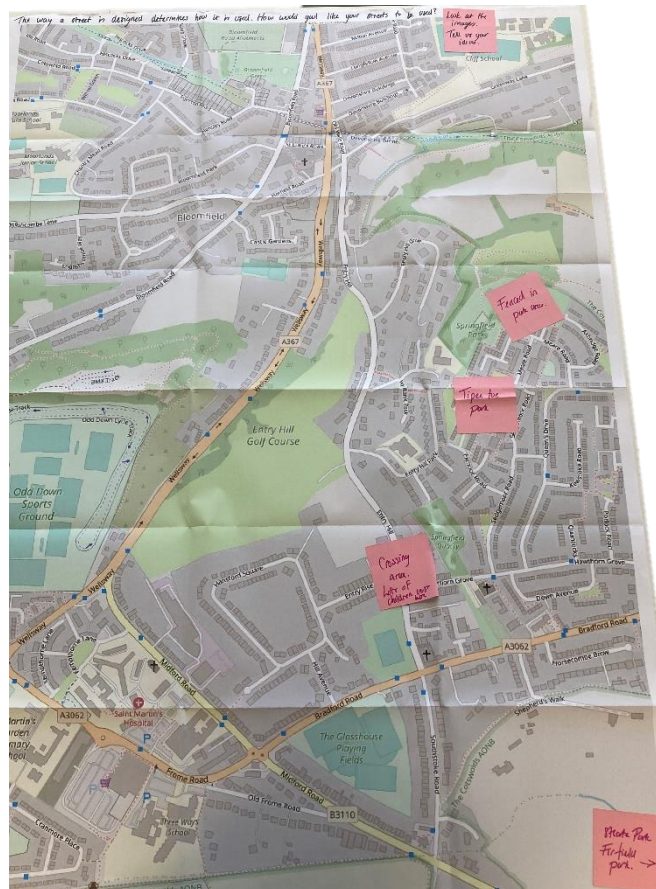
Map 4. Participants' ideas for improvements