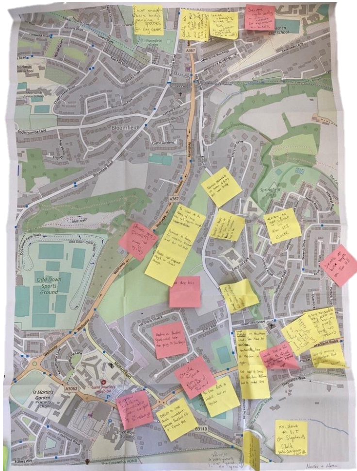
Map 6. Participants' barriers and ideas for improvement