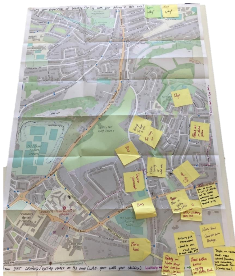
Map 1. Issues and disliked places in the Entry Hill and Fox Hill area