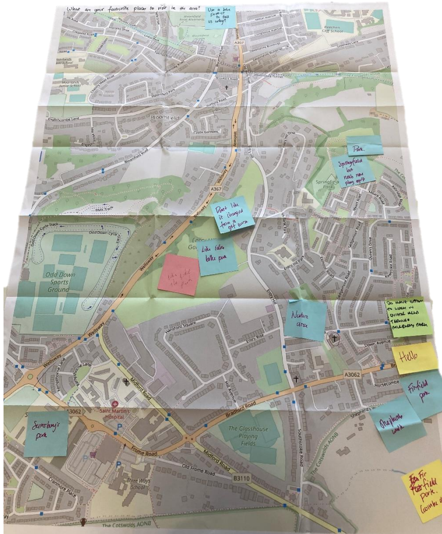
Map 2. Participants' favourite places in the Entry Hill and Fox Hill area