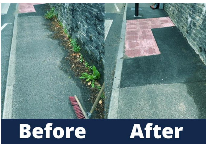
Weed removal completed on Church Hill pavement in High Littleton