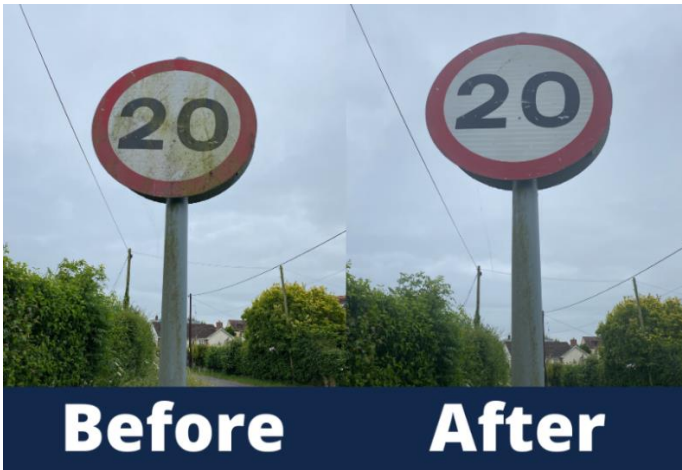
20mph road sign cleaned in Chew Stoke, Chew Valley ward