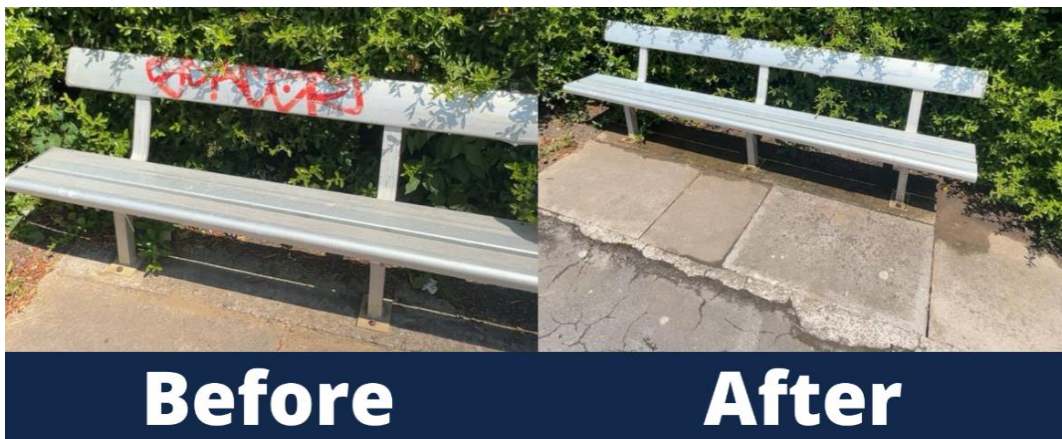
Graffiti removed from a bench in Englishcombe Lane, Moorlands

To report graffiti in public spaces, please visit the council's report it page .