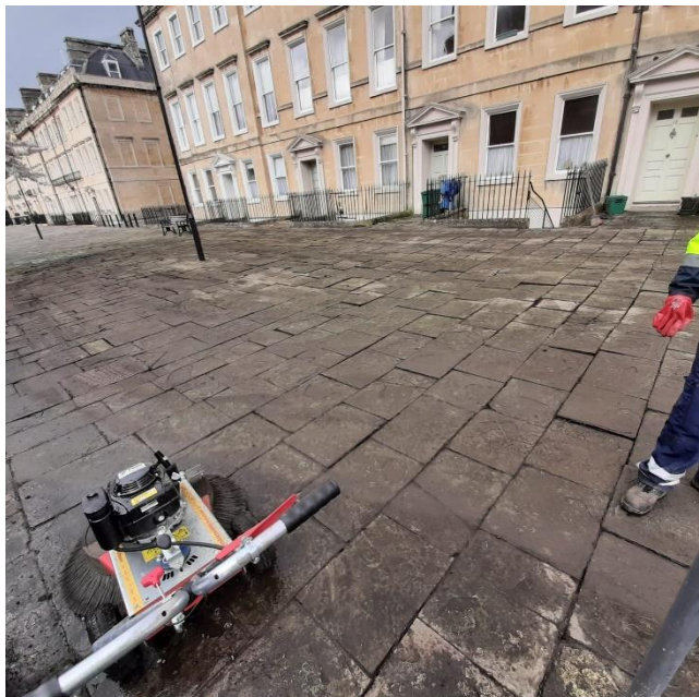
Moss and light weed remover used in South Parade, Kingsmead

As part of the Climate and Ecological Emergency response, B&NES has stopped using the chemical weed killer glyphosate. Through the Clean and Green investment, Street Cleansing have been trialling various weed removal processes, including foam stream and hot wash. The team will remove weeds through new mechanical equipment, as well as continuing to use manual removal.