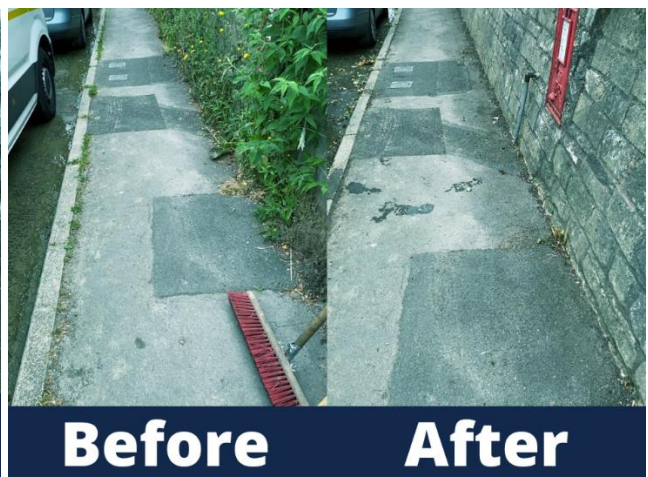
Overgrown vegetation removed on London Road East in Bathavon North