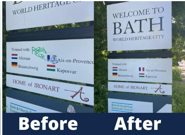
Graffiti cleaned from welcome sign on London Road West in Lambridge ward