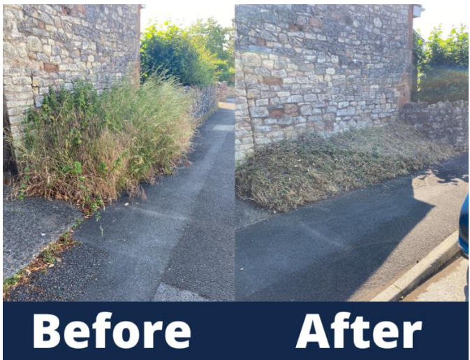
Overgrown vegetation trimmed on Home Orchard in Chew Valley