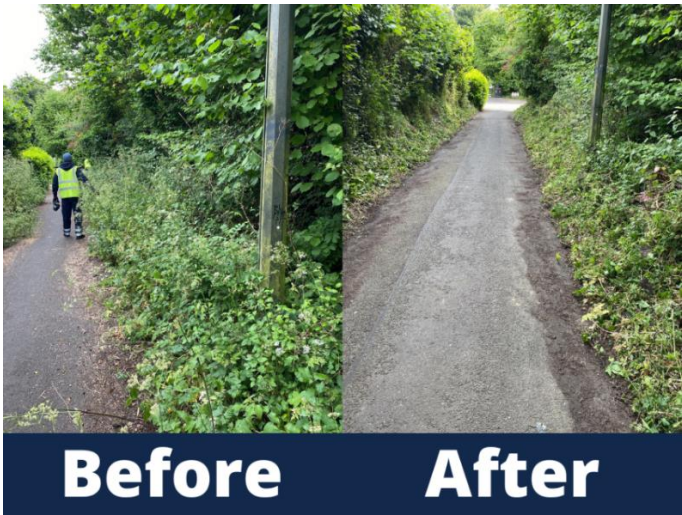
Overgrown vegetation cut back along White Ox Mead Lane in Peasedown