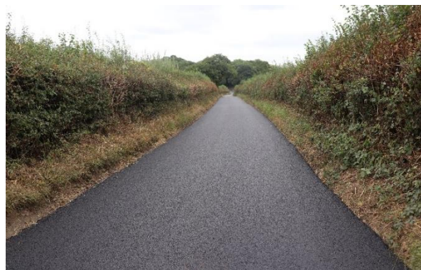
Patch work completed along Wilmington Hill, Marksbury