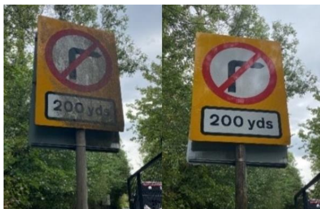
Before and after picture of signs cleaned in Keynsham