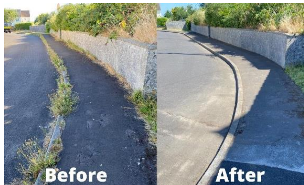
Weeding and sweeping completed along Fosseway, Westfield