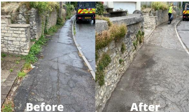
Weeding and sweeping completed along Millards Lane, Midsomer Norton

Please visit the Council's report it page to report a public highway or cleansing issue.