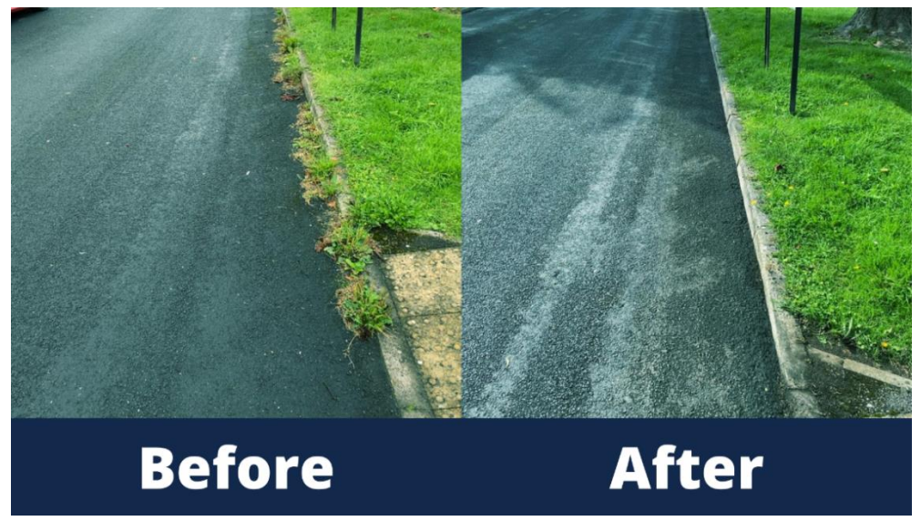
Weeds cleared from pavement on Wick House Close, Saltford ward