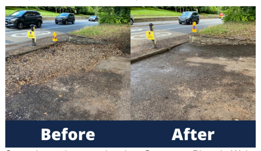
Sweeping action completed on Grosvenor Place in Walcot