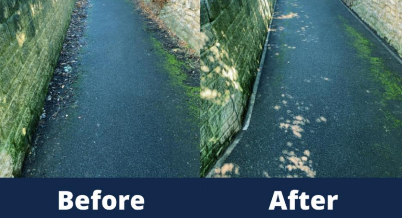
Leaves cleared along the alleyway near Red Lion Pub in Paulton ward