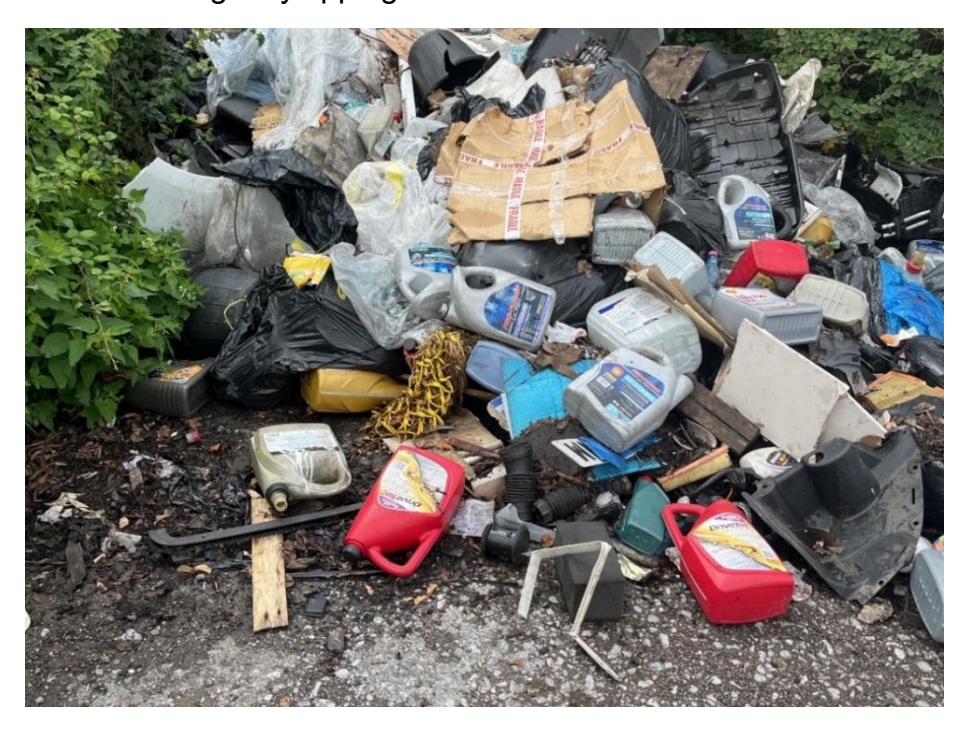
For more information about fly tipping, including how to report it visit our website: <a href="https://beta.bathnes.gov.uk/report-fly-tipping">https://beta.bathnes.gov.uk/report-fly-tipping</a>

The Environmental Enforcement team recently issued a fixed penalty notice of £300 to an offender who was caught fly tipping in B&NES. View below the area which was fly tipped.