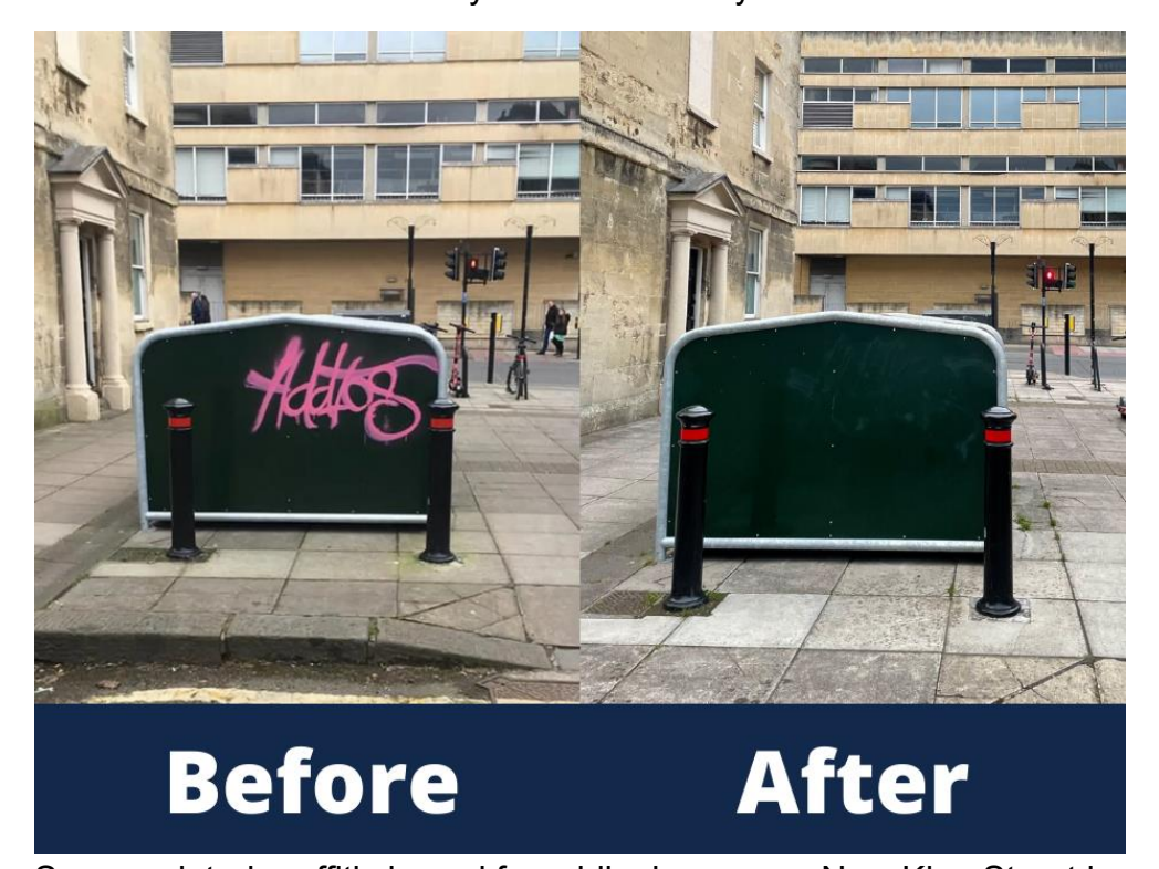
Spray-painted graffiti cleared from bike hangar on New King Street in Kingsmead ward

To report graffiti in public spaces, please visit the council's <u>Report it page</u>. Property owners will need to fill out the <u>online form</u> to request graffiti removal.