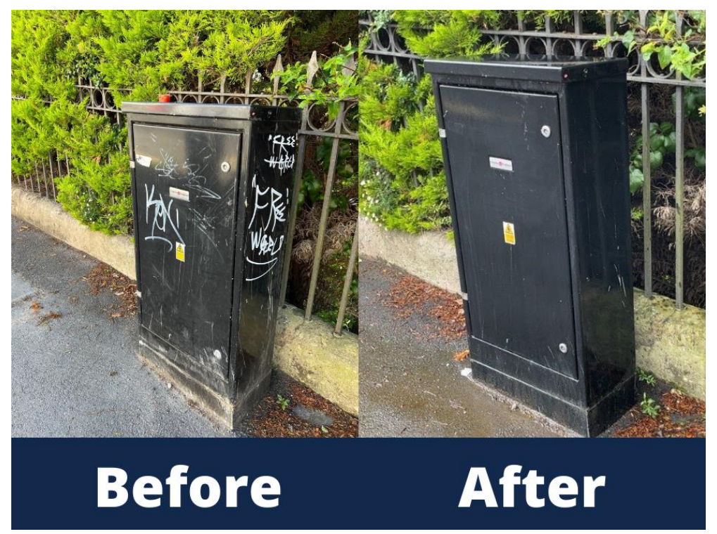
Graffiti removed from a utility cabinet on Raby Place in Bathwick

Clean and Green continue to remove graffiti on domestic and commercial properties. This month, 33 reports related to graffiti removal was completed in B&NES. Check out some of the before and after images of graffiti cleared in Bathwick and Kingsmead wards.