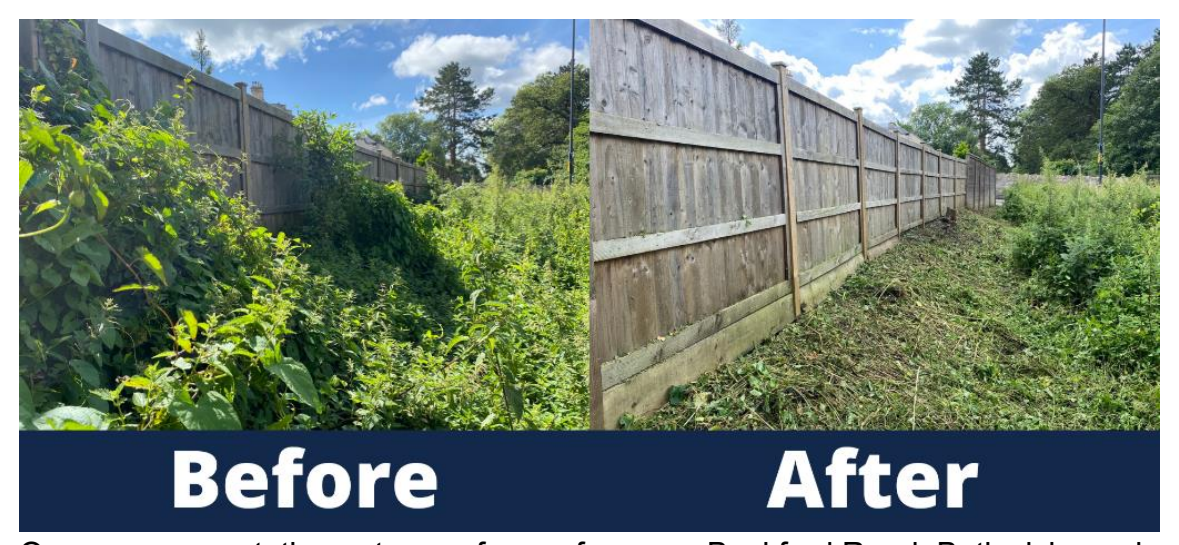
Overgrown vegetation cut away from a fence on Beckford Road, Bathwick ward