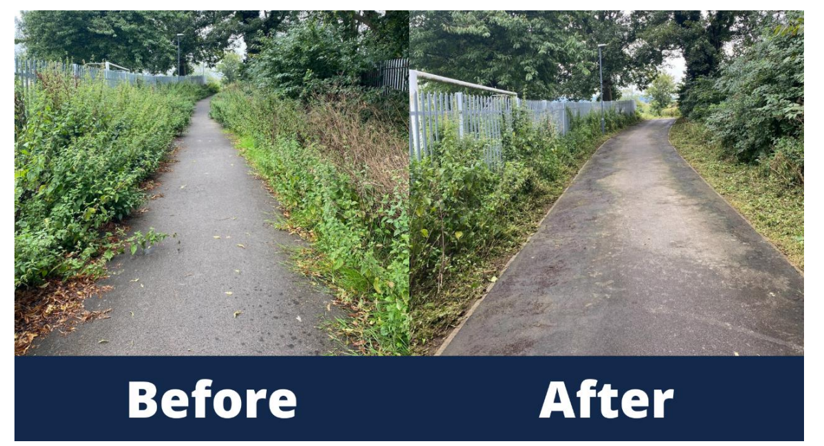
Vegetation trimmed on Norton Hill to support pathway clearance in Midsomer Norton