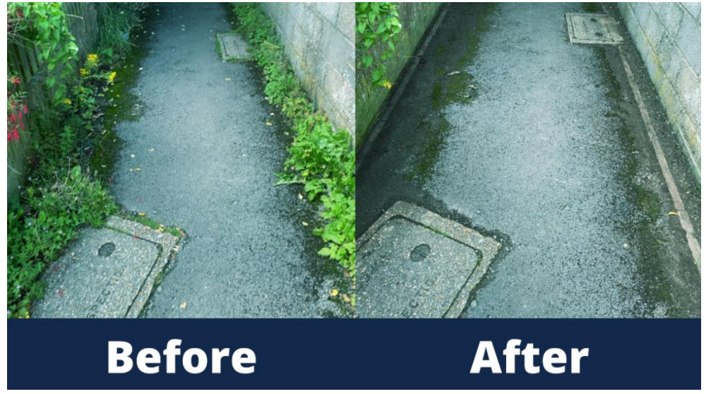
Weeds removed along laneway between waterside way and waterside crescent in Westfield