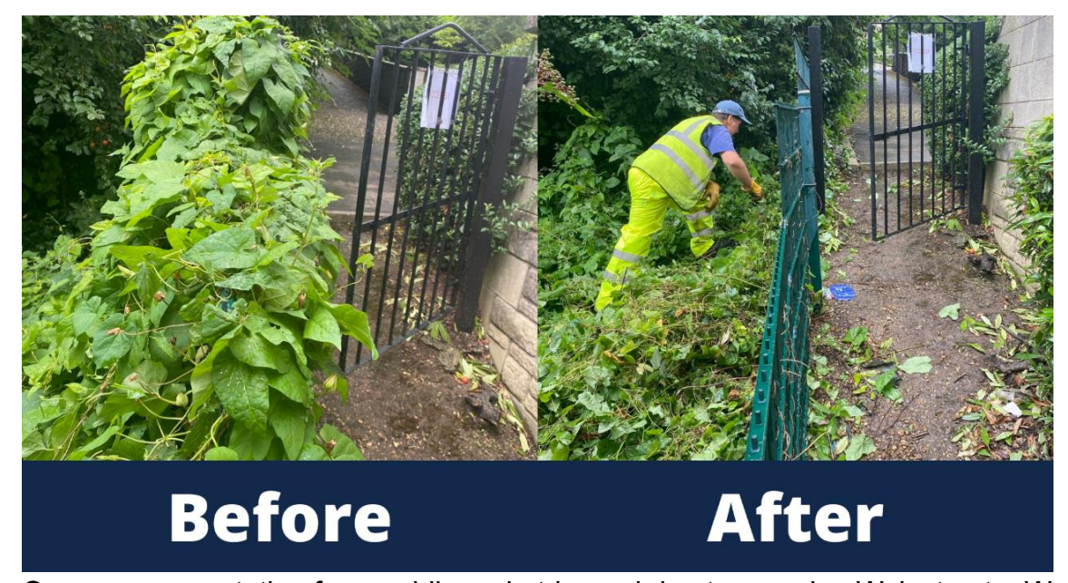
Overgrown vegetation from public park, trimmed due to covering Walcot gate, Walcot