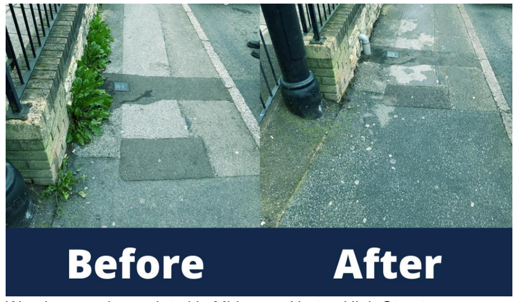
Weed removal completed in Midsomer Norton High Street