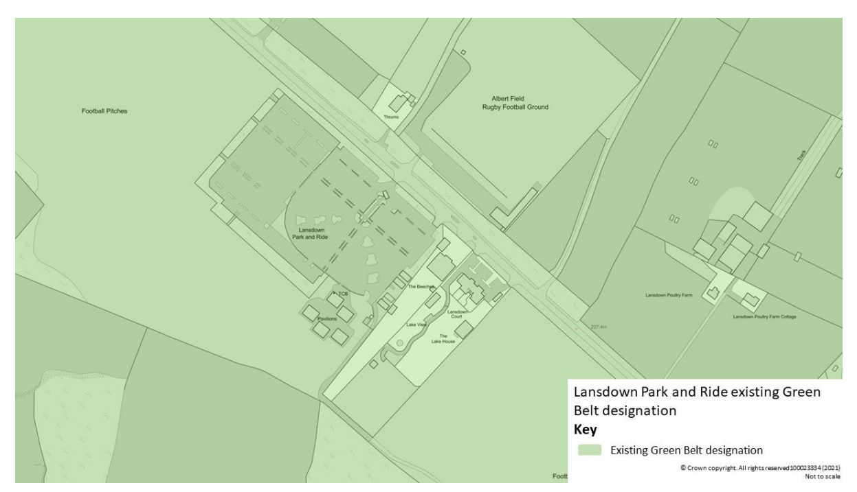
Figure 6: Existing green belt boundary – Lansdown Park and Ride site

5.45 The new Green Belt boundary at Lansdown is proposed as shown in figure 7. The retention of the existing tree belts along the north eastern, north western, and the majority of the south western edges of the site form a clear Green Belt boundary, with along the north east of the site strengthened further by the presence of Lansdown Road.