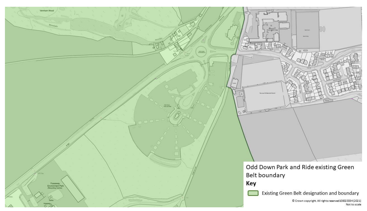
Figure 2: Existing Green Belt boundary – Odd Down Park and Ride site

5.43 The new Green Belt boundary at Odd Down is proposed as shown at figure 3. The A367 forms a strong Green Belt boundary to the west and north, and Coombe Hay Lane and its adjacent tree cover form a clear boundary to the east. The southern edge of the site is less strongly defined, and the brownfield site to the south west of the Park and Ride creates a weaker distinction than would be the case if it were open farmland. Therefore, a greenfield gap is retained between the two, with this area retained as Green Belt.