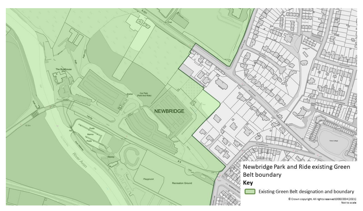
Figure 4: Existing Green Belt boundary - Newbridge Park and Ride site

5.44 The new Green Belt boundary at Newbridge is proposed as shown at figure 5. The retention of the significant existing tree coverage on every edge of the site forms a clear Green Belt boundary, with the boundary to the south strengthened further by the presence of the A4.