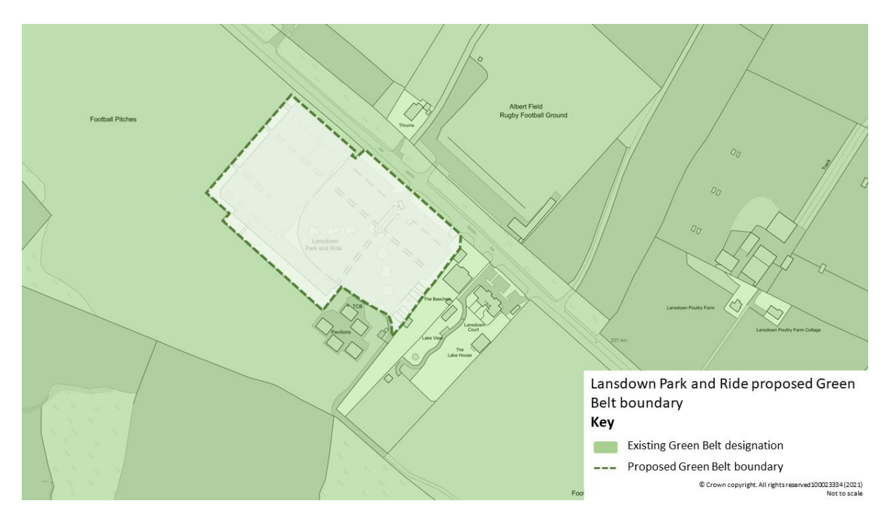
Figure 7: Proposed green belt boundary – Lansdown Park and Ride site