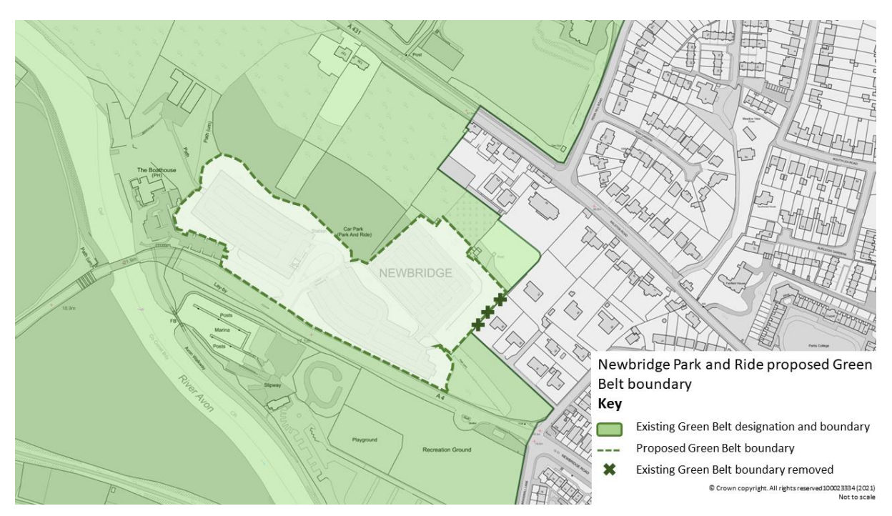
Figure 5: Proposed Green Belt boundary - Newbridge Park and Ride site