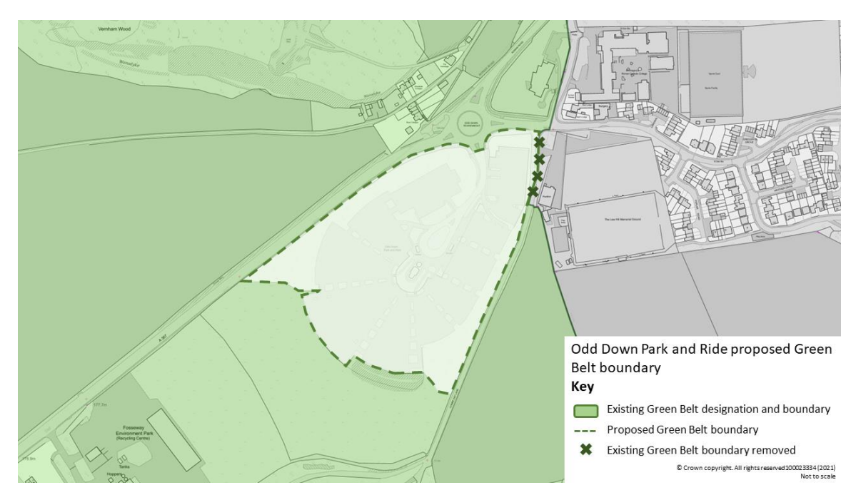
Figure 3: Proposed Green Belt boundary - Odd Down Park and Ride site