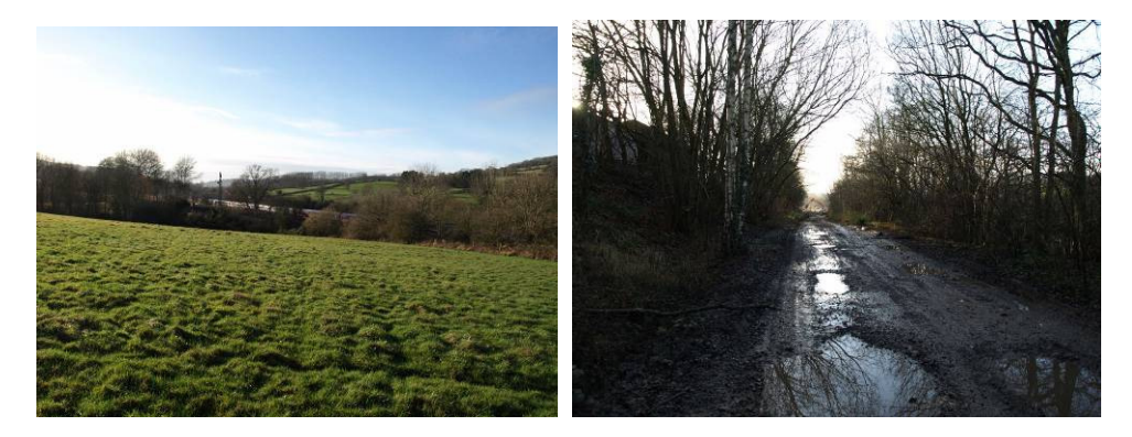
Photo 9.3 View to west from adjacent field Photo 9.4 View along the site access track