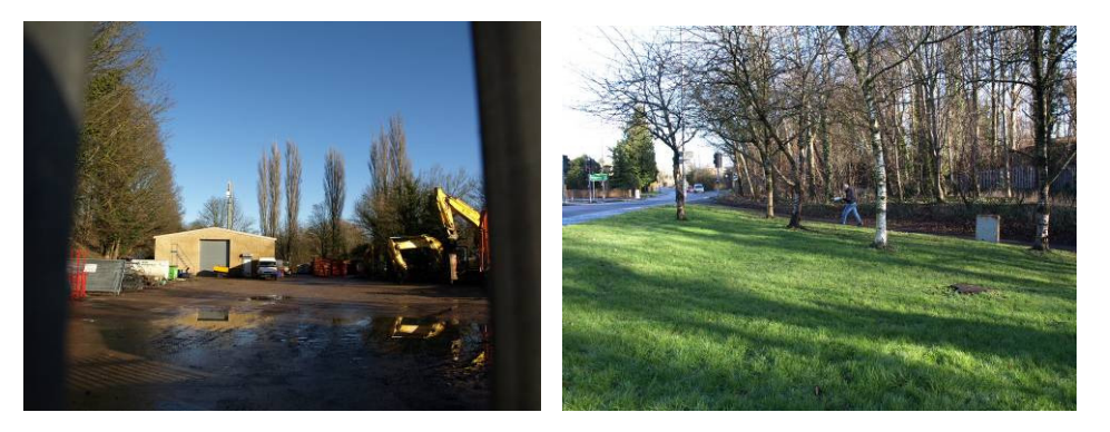
Photo 5.1 Southern Site - View from A363 Photo 5.2 Northern Area - View East from A363