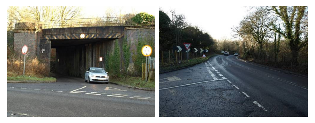
Photo 9.1 Restricted View through Bridge Photo 9.2 Poor Visibility to the Left

Drivers waiting at the give-way line to the A4 have good visibility to the right; but visibility to the left is restricted due to the alignment of the eastbound A4 approach (Photo 9.2). There is also no sheltered provision for vehicles turning right from the A4 at this junction; whilst forward visibility for drivers approaching the junction from the west is restricted. In consequence, an increased incidence of vehicles waiting to turn right in this location would increase the risk of 'shunt' accidents.