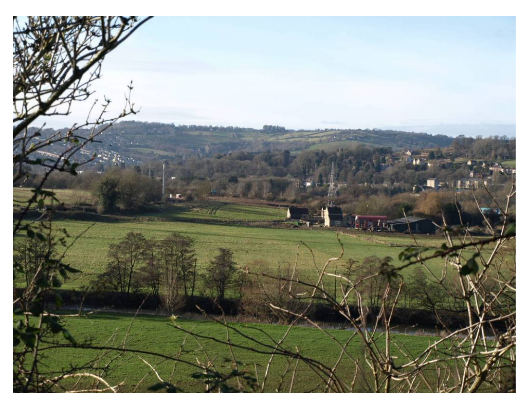
Photo 8.1 Site H: View west across the River Avon floodplain from Bradford Road in Bathford. Bathampton Farm is centre-right

In the wider context, the site is located within the Bathford and Limpley Stoke Valley Landscape Character Area (LCA 18), as described for Site A above. Whilst the pastoral use of the site identifies it as an important component of the generally rural character of the valley, the settlements of Bathford and Batheaston and the adjacent rail and road transportation routes and adjacent salvage yard exert a strong, and in the case of the latter, detracting influence on the character of the site. However, the strategic and pivotal location of the site opposite the confluence of the By Brook and Limpley Stoke valleys is important in terms of preserving the integrity of the valley landscape and the landscape quality of the site is therefore considered to be High to Moderate. Any development at this location would therefore need to be carefully assessed and designed to ensure it integrated effectively into the surrounding high quality and sensitive landscape. It appears unlikely that this would be entirely feasible with regard to the proposal for three level multi-storey car park, particularly once the re-aligned railway, new diamond interchange and slip roads off the A4 and associated box section tunnel under the mainline railway and A4 infrastructure is taken into consideration.