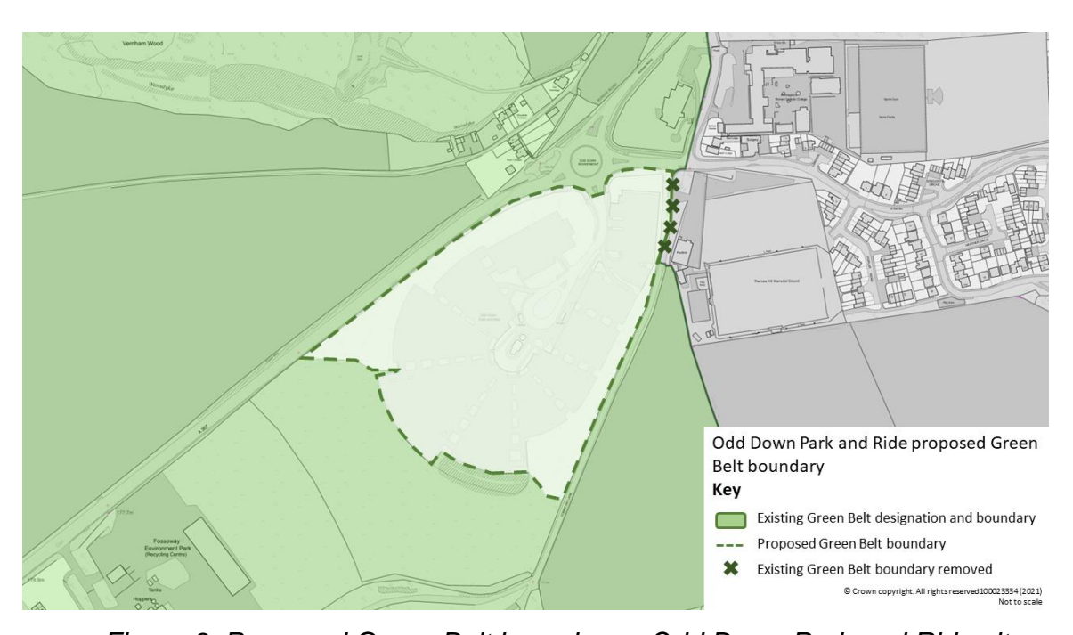
Figure 3: Proposed Green Belt boundary – Odd Down Park and Ride site 5.44 The new Green Belt boundary at Newbridge is proposed as shown at figure 5. The retention of the significant existing tree coverage on every edge of the site forms a clear Green Belt boundary, with the boundary to the south strengthened further by the presence of the A4.