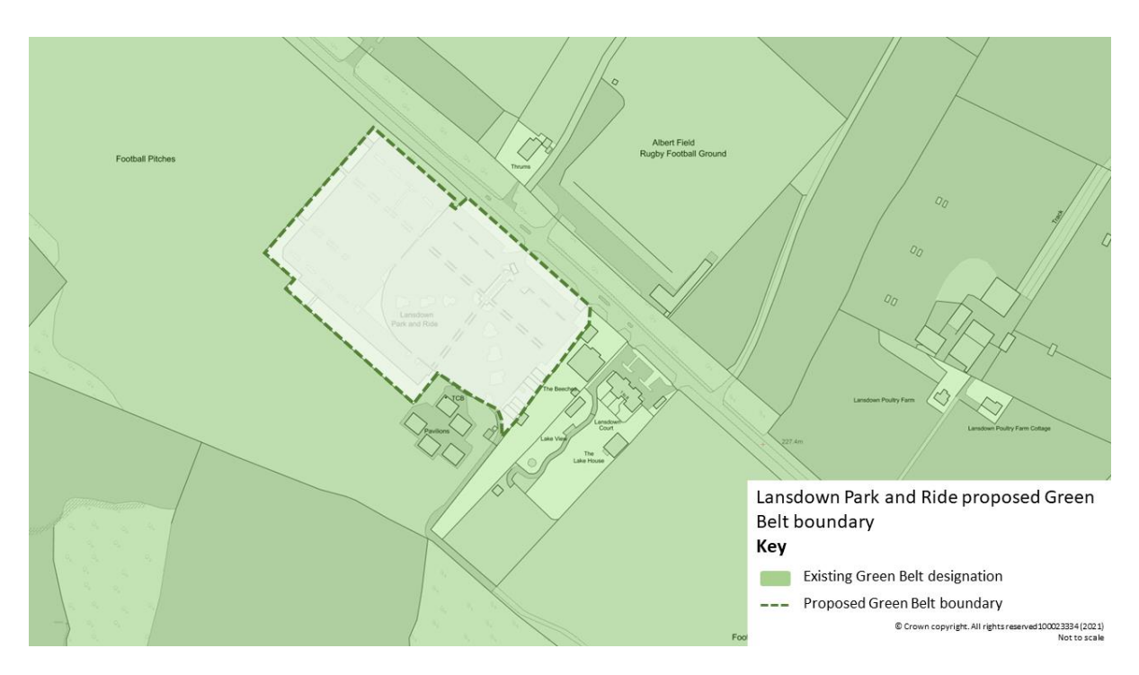
Figure 7: Proposed green belt boundary – Lansdown Park and Ride site