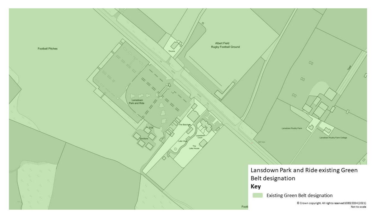
Figure 6: Existing green belt boundary - Lansdown Park and Ride site