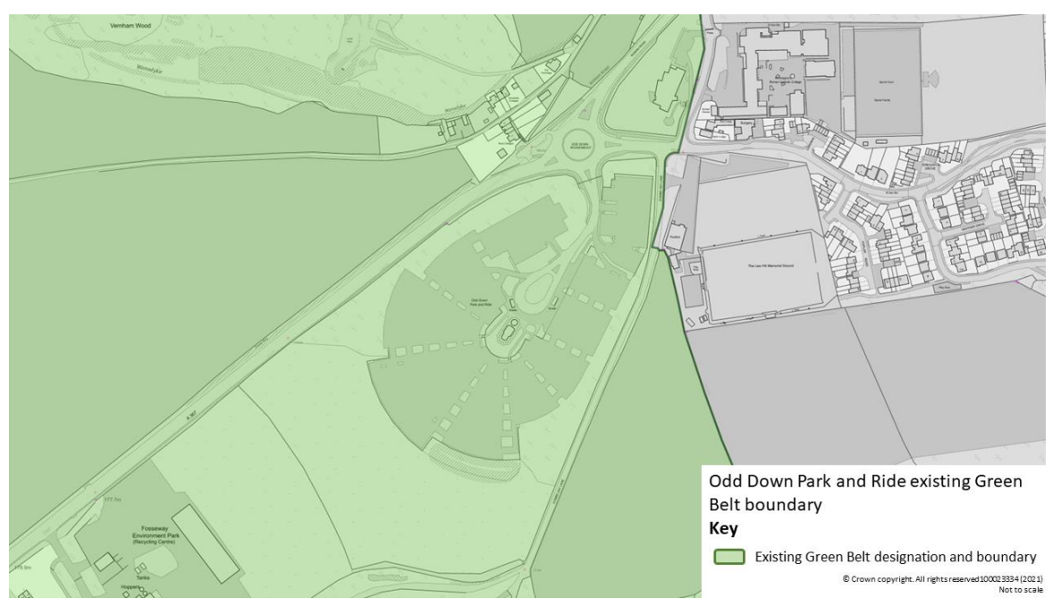
Figure 2: Existing Green Belt boundary - Odd Down Park and Ride site

5.43 The new Green Belt boundary at Odd Down is proposed as shown at figure 3. The A367 forms a strong Green Belt boundary to the west and north, and Coombe Hay Lane and its adjacent tree cover form a clear boundary to the east. The southern edge of the site is less strongly defined, and the brownfield site to the south west of the Park and Ride creates a weaker distinction than would be the case if it were open farmland. Therefore, a greenfield gap is retained between the two, with this area retained as Green Belt.