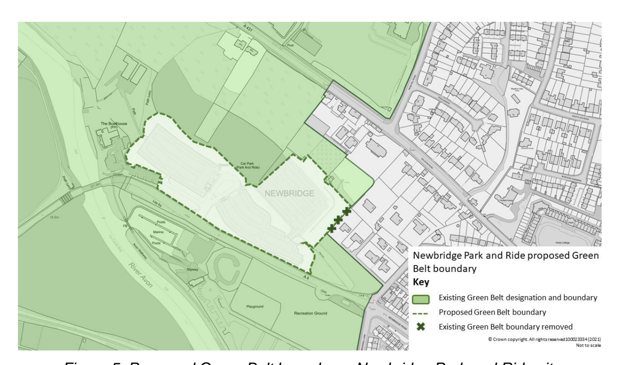
Figure 5: Proposed Green Belt boundary - Newbridge Park and Ride site 5.45 The new Green Belt boundary at Lansdown is proposed as shown in figure 7. The retention of the existing tree belts along the north eastern, north western, and the majority of the south western edges of the site form a clear Green Belt boundary, with along the north east of the site strengthened further by the presence of Lansdown Road.