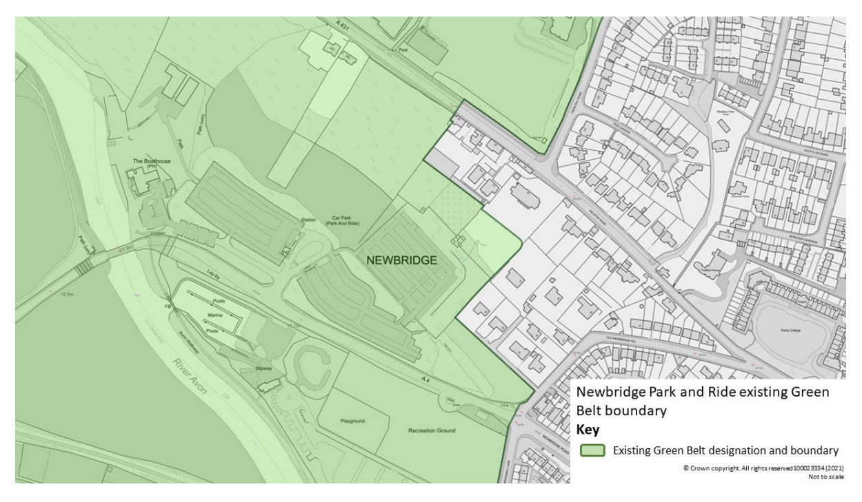
Figure 4: Existing Green Belt boundary - Newbridge Park and Ride site