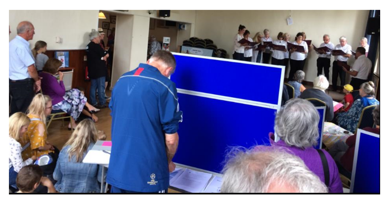
Figure 2: Options Document consultation at Stanton Drew Flower Show, July 2017, aided by the Community Choir.

Once again thank you for having your say to help shape our Parish.