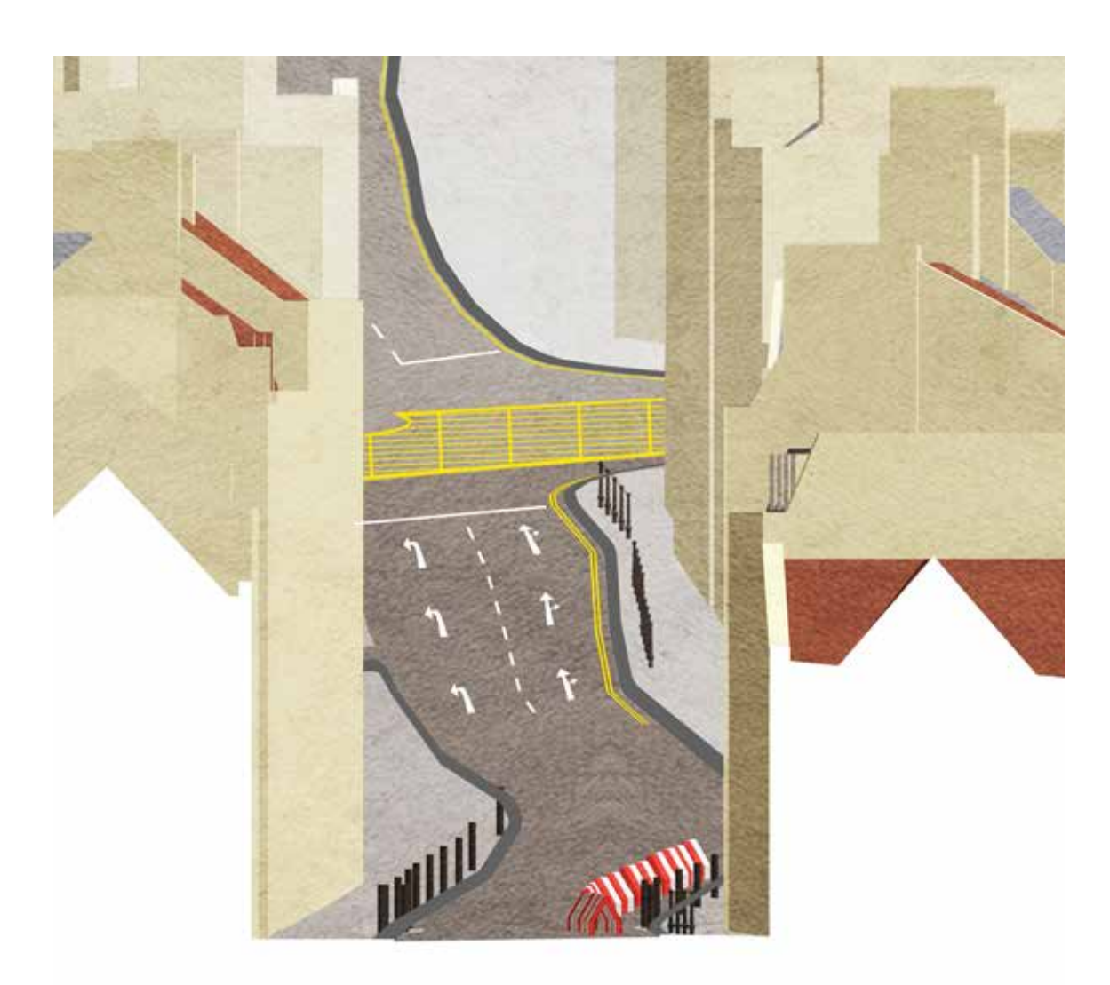
Broad Street (south) design concept artist's impressions