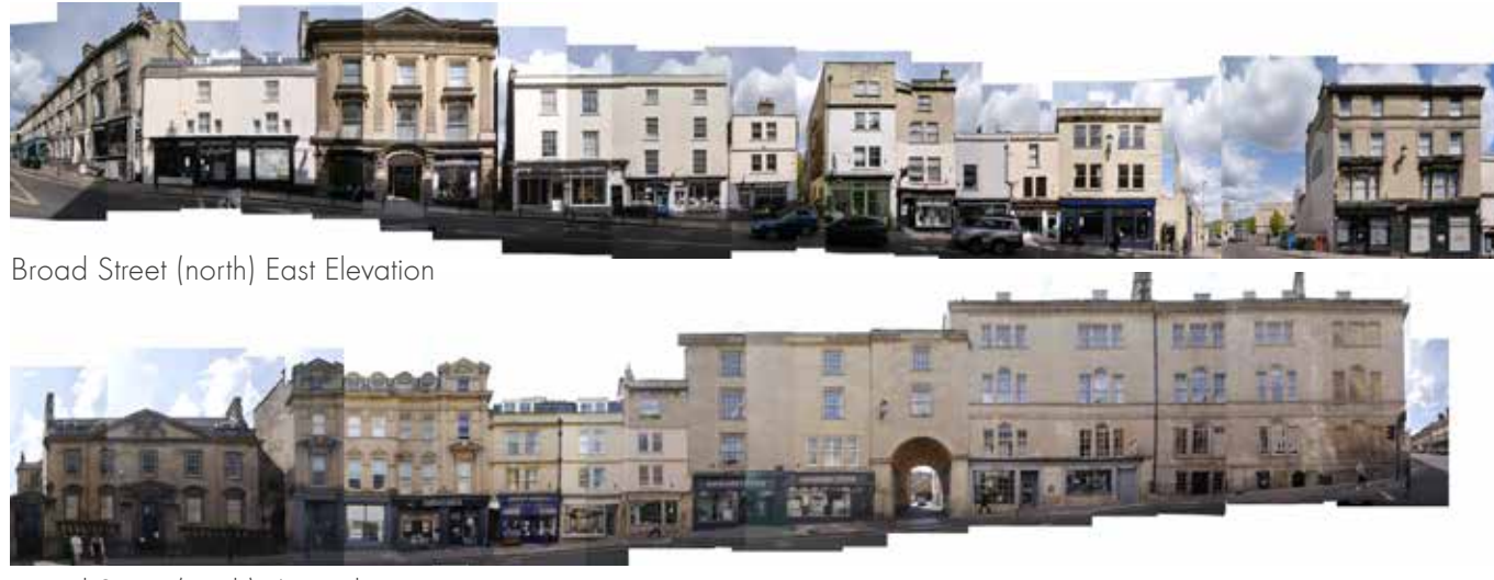
Broad Street (north) West Elevation