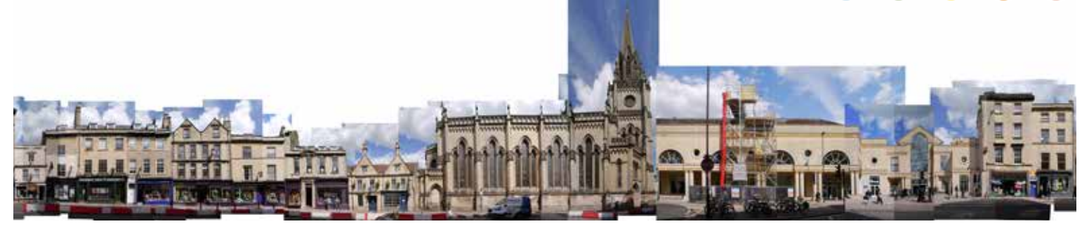
Broad Street (south) East Elevation

Broad Street (north): As with the southern section is dominated by the narrow pavements and heavy traffic. A number of the buildings are in need or repair and/or redecoration which add to a somewhat overlooked area of the city. Connections through to Walcot Street and the Cattlemarket are clearly missed opportunities and could provide a unique and characterful area of the city.